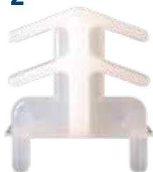
Terminale nylon 2