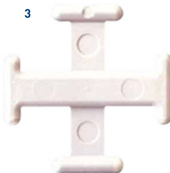
Nylon centre key